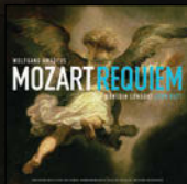
Dunedin Consort Mozart: Requiem Reconstruction of first performance