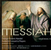
Dunedin Consort Handel: Messiah Dublin Version, 1742