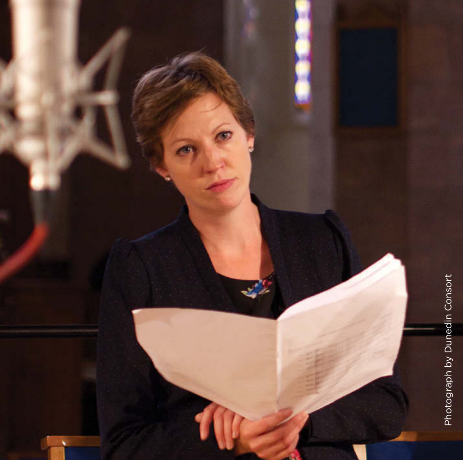
Photograph by Dunedin Consort