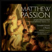
Dunedin Consort J.S. Bach: Matthew Passion Last Performing Version, c.1742