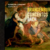
Dunedin Consort J.S. Bach: Six Brandenburg Concertos

For even more great music visit linnrecords.com