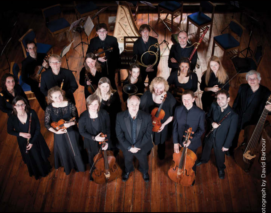
Photograph by David Barbour