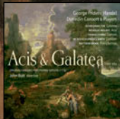
Dunedin Consort Handel: Acis & Galatea Original Cannons Performing Version, 1718