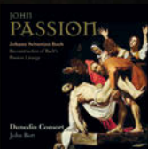
Dunedin Consort J.S. Bach: John Passion Reconstruction of Bach's Passion Liturgy