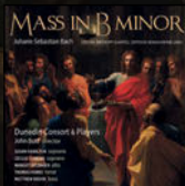
Dunedin Consort J.S. Bach: Mass in B minor Breitkopf & Härtel Edition, edited by J. Rifkin, 2006